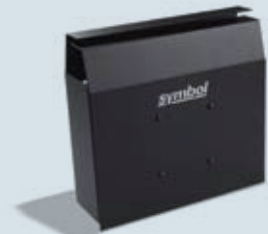
Heavy Weather Kit KT-5181-HW-01R