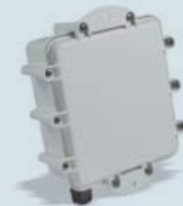
48V Transformer and Power Surge Protector AP-PSBIAS-5181-01R

Not Shown: Wall Pole and Mounting Kit KT-5181-WP-01R